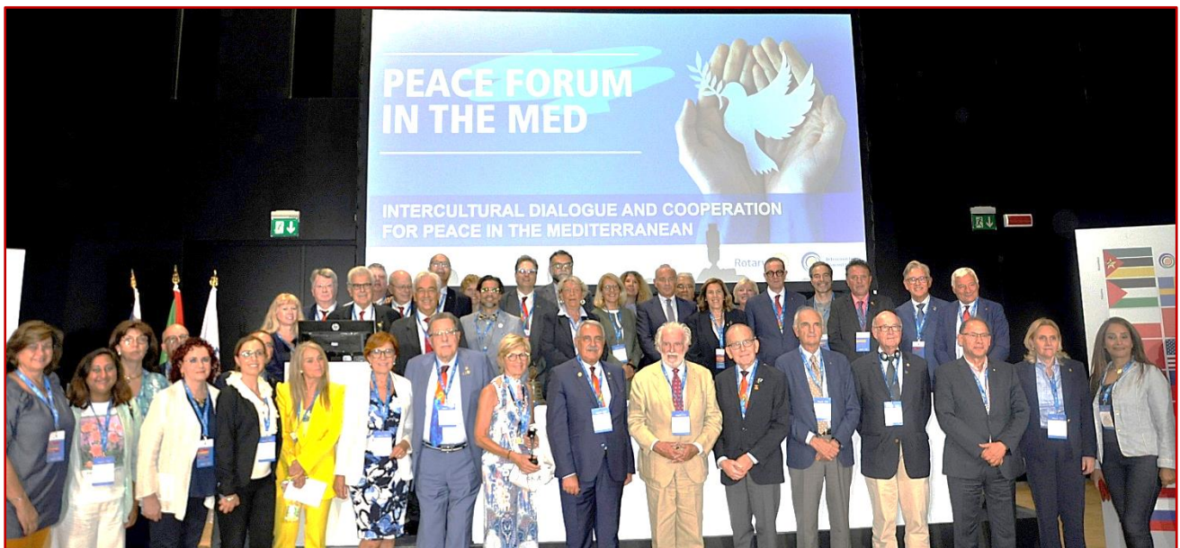
Conclusion of the Forum. Group photo with some of the participants.

"If you really want Peace, prepare Peace"