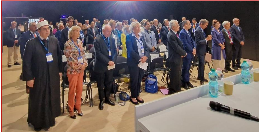
Participants during the "Honors to the Flags"